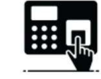
Finger Print System