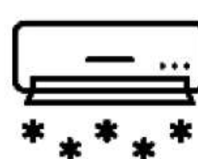
Centrally Air Condition