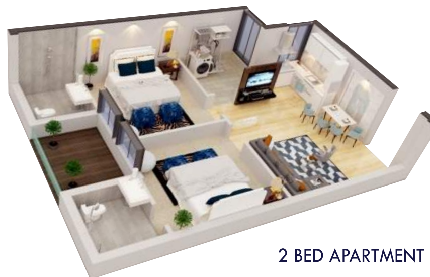
2 BED APARTMENT